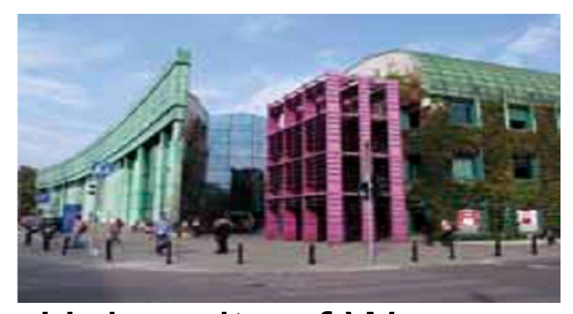
University of Warsaw Poland

Anticipated duration: till the end of academic year (30.09).